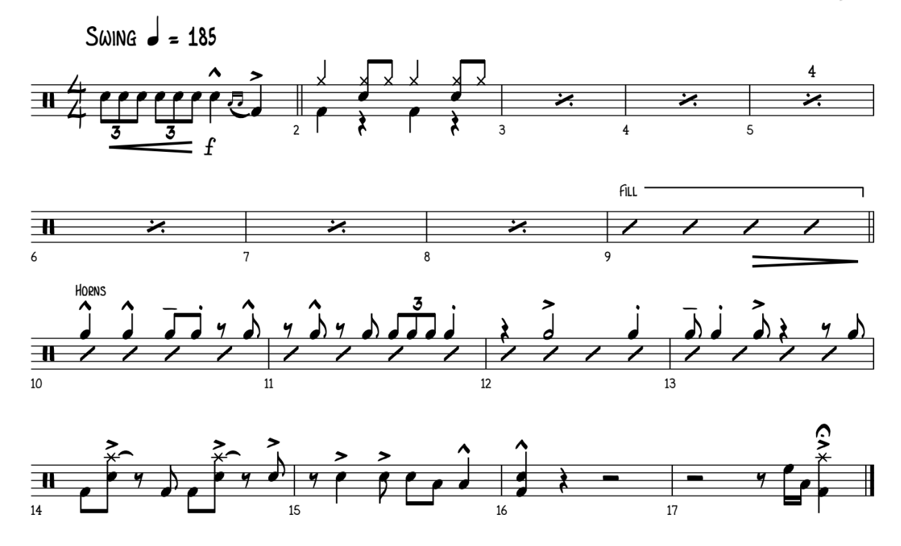
© 2023 SkippySounds, LLC For Backing Tracks and More resources visit <u>www.SkippySounds.com/AllStateJazz</u>